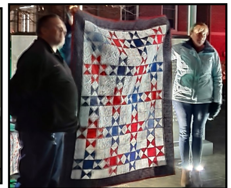
Above are pics of a few of the Quilt of Valor Presentations.