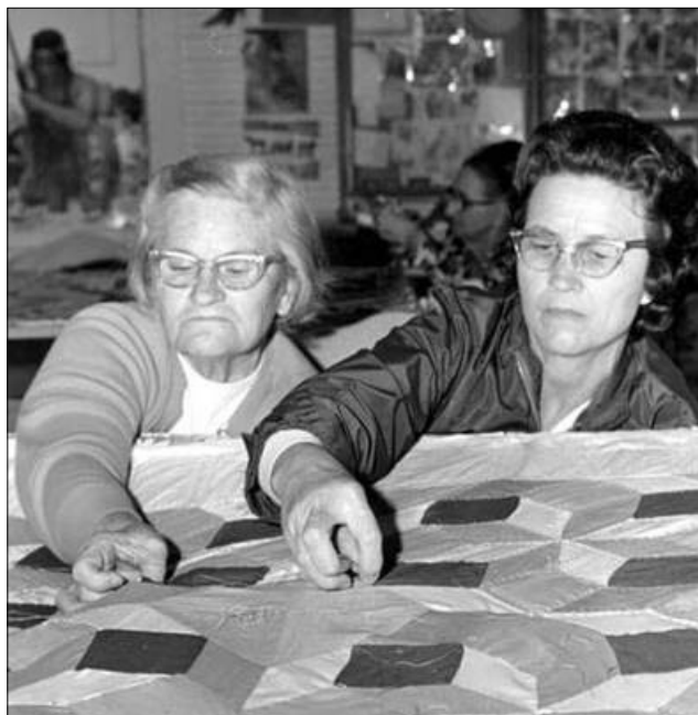
The original "long-arm quilters."