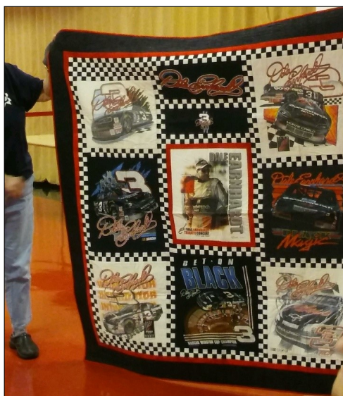
From September Show and Tell -

Thank you, Darlene for keeping us up to date!