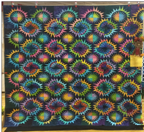
Second Place - Leana McCutcheon Celebration