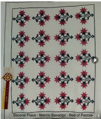
Second Place - Marcia Savadge - Bed of Peonies 2/3